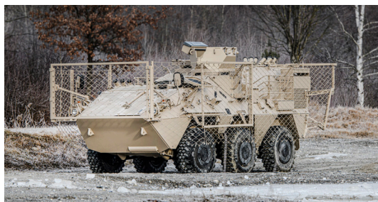
Side Protection SidePRO-LASSO