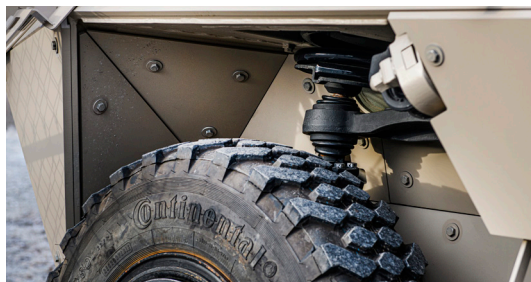
Side Protection SidePRO-KE