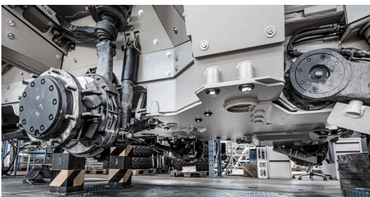
Mine Protection MinePRO