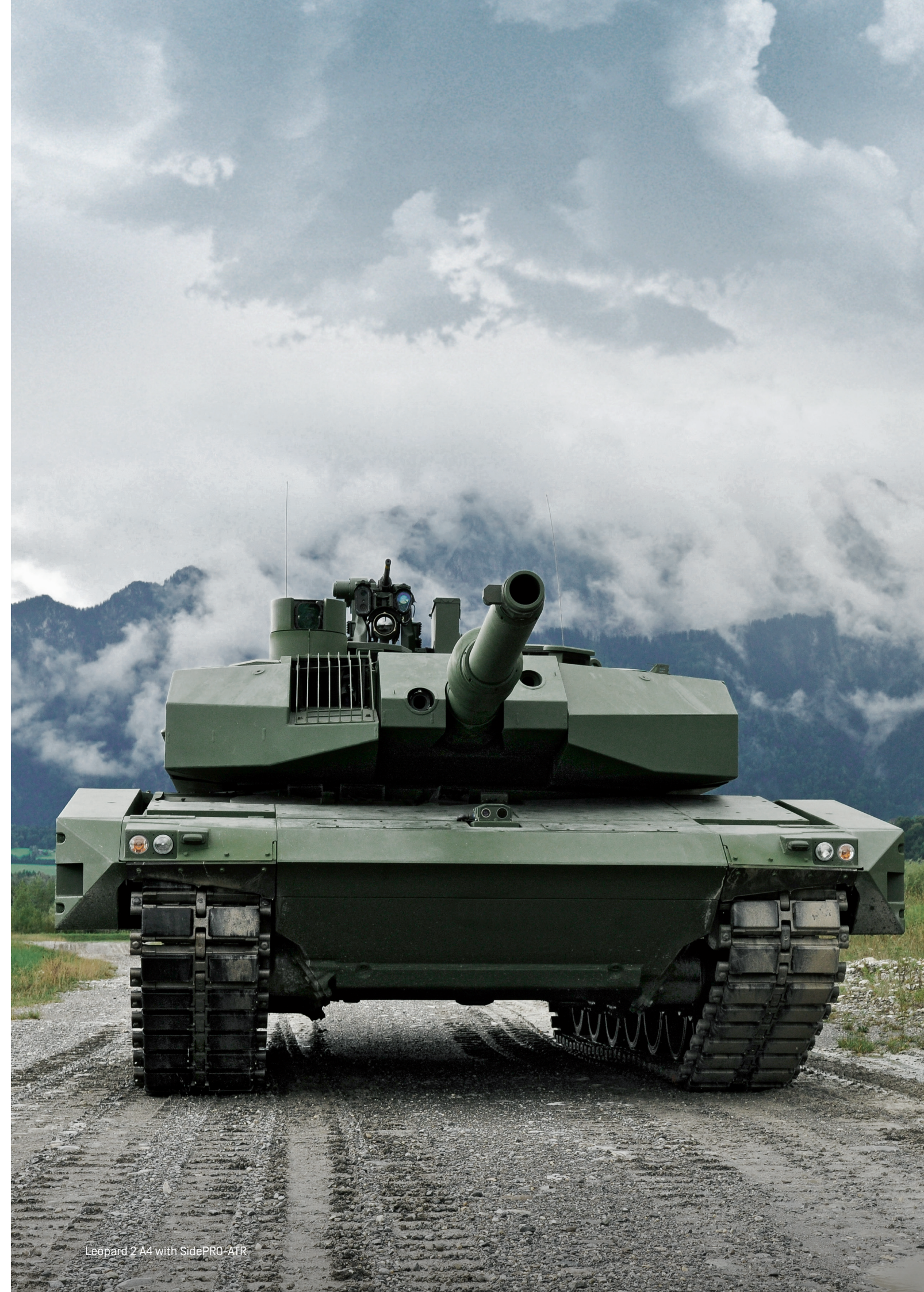
Leopard 2 A4 with SidePRO-ATR

Whether it is large-caliber ammunition, missiles or mines: Our products are specifically tailored to meet our customers' requirements.